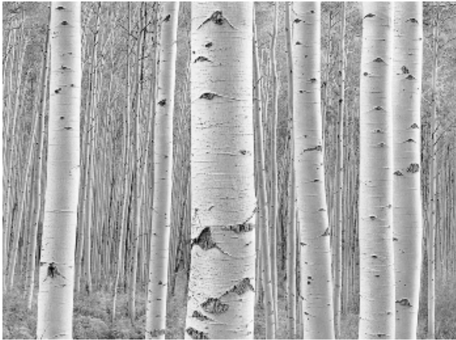
ASPEN GROVE, DUSK NEAR ASPEN, COLORADO