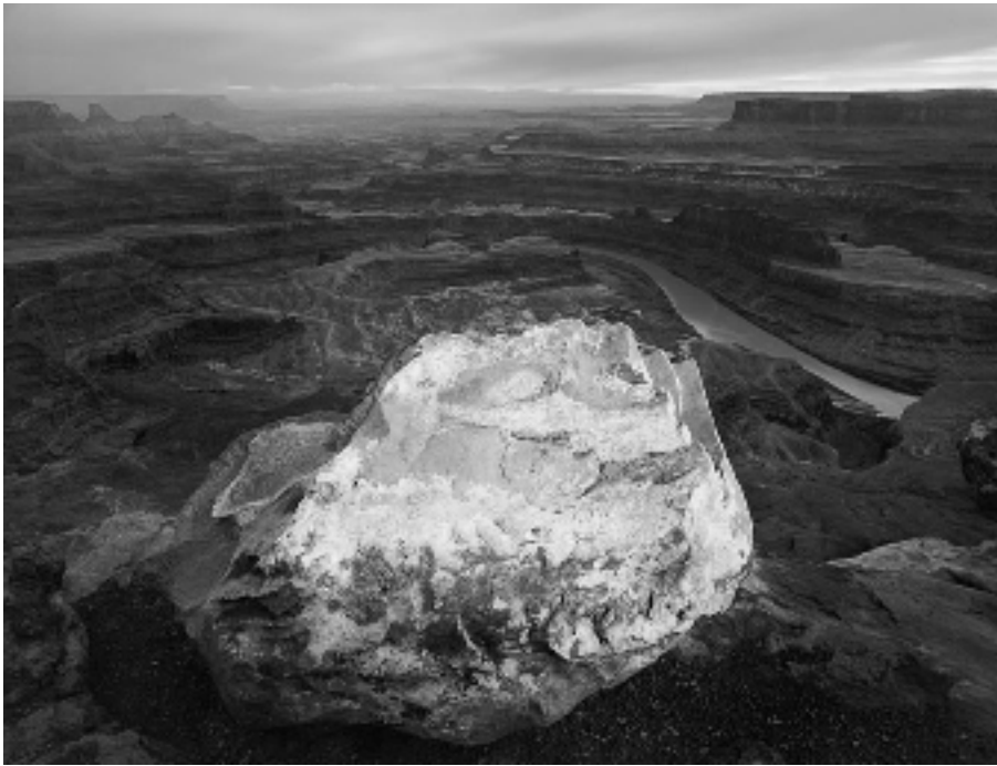
WHITE BOULDER DEAD HORSE POINT, UTAH