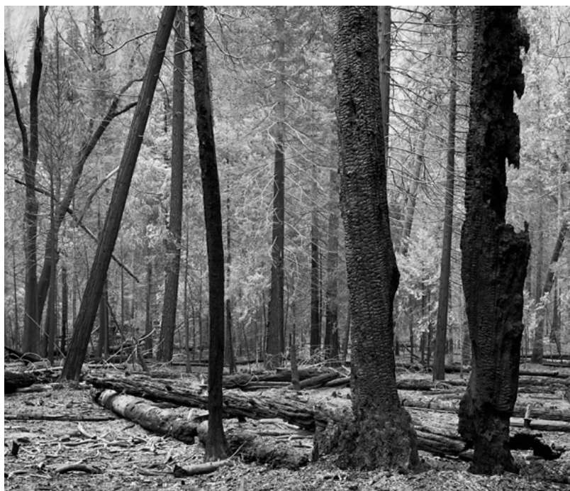
CHARRED FOREST YOSEMITE VALLEY CALIFORNIA