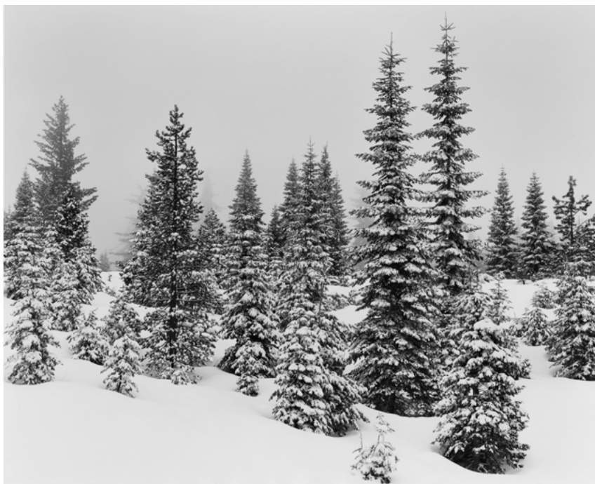
FOREST IN SNOW YOSEMITE NATIONAL PARK CALIFORNIA