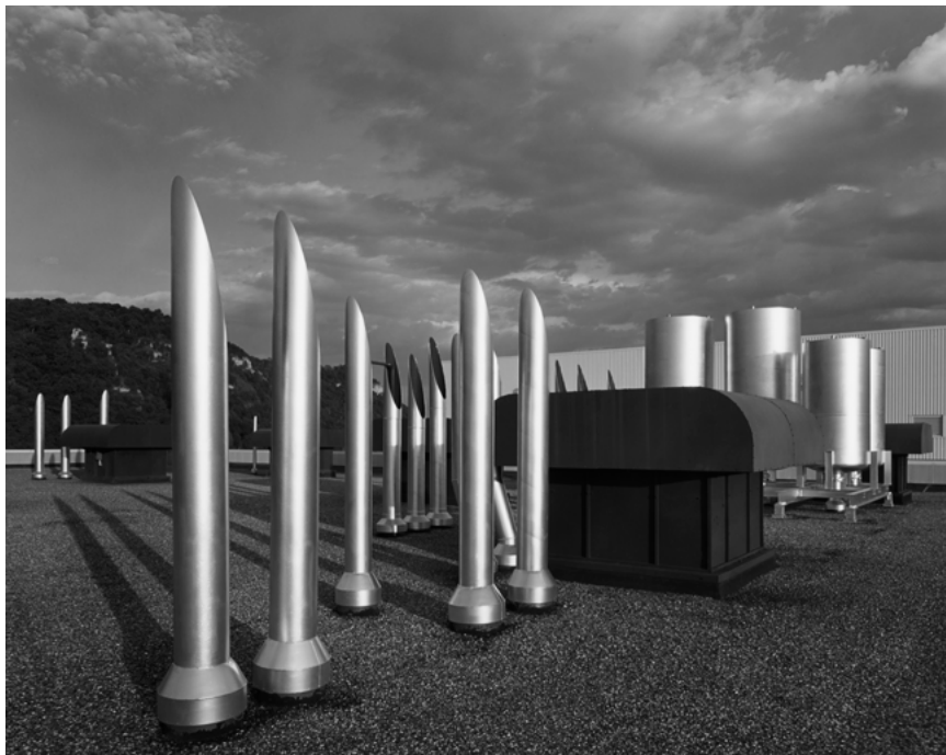
STEAM VENTS AND CLOUDS ALMA, WISCONSIN