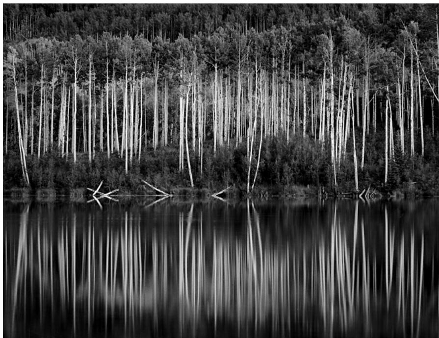
ASPENS, REFLECTIONS SNOWMASS VILLAGE COLORADO