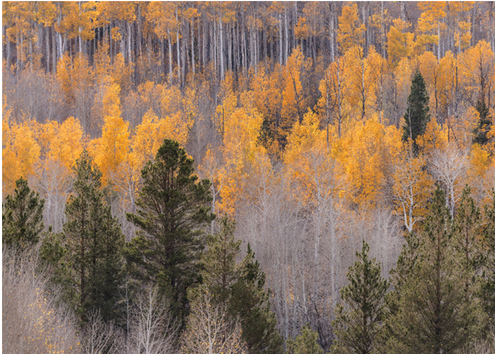
LATE AUTUMN ASPEN CONWAY SUMMIT EASTERN SIERRA, CALIFORNIA