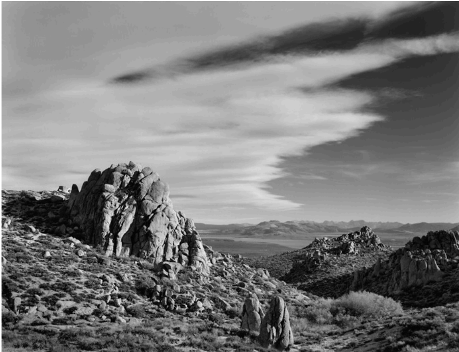
BOULDERS AND CLOUDS MONO BASIN, CALIFORNIA