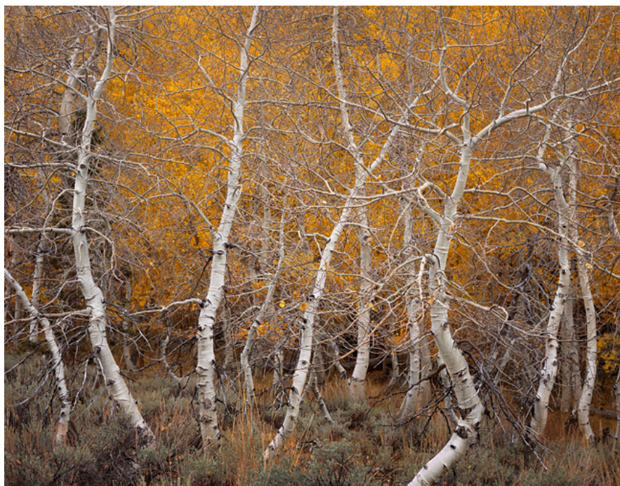
ASPEN DANCE, AUTUMN JUNE LAKE, CALIFORNIA