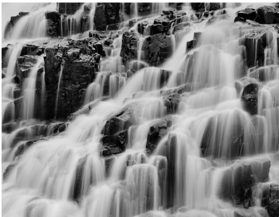
CASCADE SAN JUAN MOUNTAINS, COLORADO