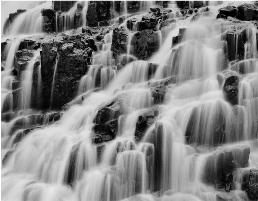
CASCADE SAN JUAN MOUNTAINS, COLORADO