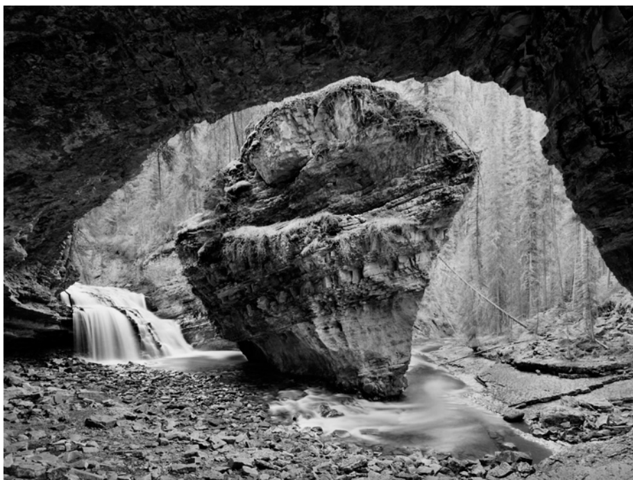
GEOLOGIC CONUNDRUM BANFF NATIONAL PARK, CANADA