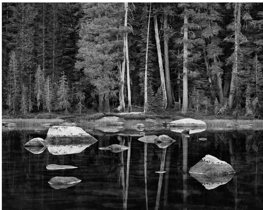
WHITE BOULDERS AND FOREST DAWN YOSEMITE NATIONAL PARK CALIFORNIA